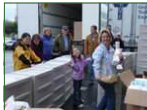
Teams of people showed up in Anchorage to help load the trucks of furniture