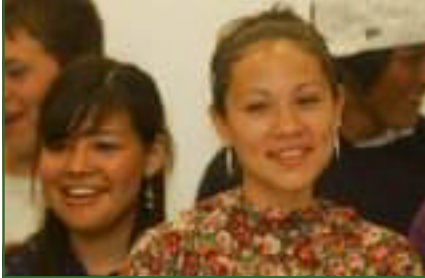
Two Alaskan's of many of CHIC

This summer almost 125 students and staff from across the state of Alaska began a journey that covered thousands of miles, numerous plane and bus transfers and most of the United States. Though it was significant in terms of physical travel, the spiritual journey that began during that same week was for many of our students a much longer road and an even more significant experience. Joining a diverse group of students from