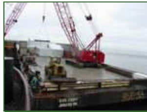
The truck then hauls everything to the barge.

We could certainly fill up the whole Chilling News with only a tidbit of all that God did and is doing. But please join us by remembering both the victims as they cope with their losses and those who are on a rigorous schedule to turn tragedy into thanksgiving by November 23!